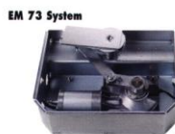
EM 73 System