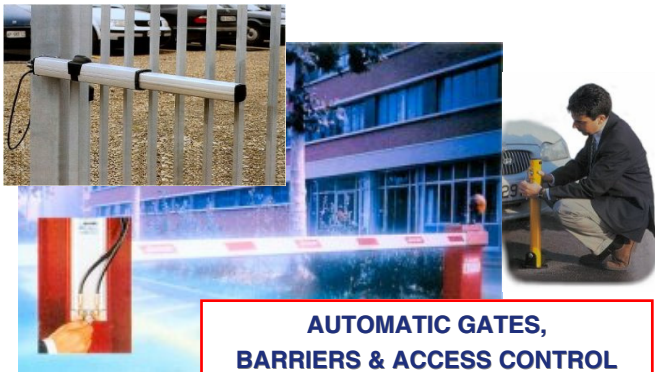
AUTOMATIC GATES, BARRIERS & ACCESS CONTROL

Many businesses now integrate their Health & Safety with their Security requirements. This arises from one simple fact: unauthorised entry to insecure premises (or yard areas) also creates a significant Health & Safety issue — and one which could cost your business dearly .