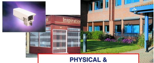
PHYSICAL & ELECTRONIC SECURITY

The best way to secure your premises, particularly on industrial estates, is by making it impossible for thieves to gain entry. Don't just assume that your “NACOSS-approved” alarm system will do the trick — our police forces are generally overstretched and it will take them time to attend. Meanwhile the burglar may already have broken in, stolen valuable assets and caused the usual mayhem associated with the event. Seldom does your insurance fully cover the “hassle” cost.